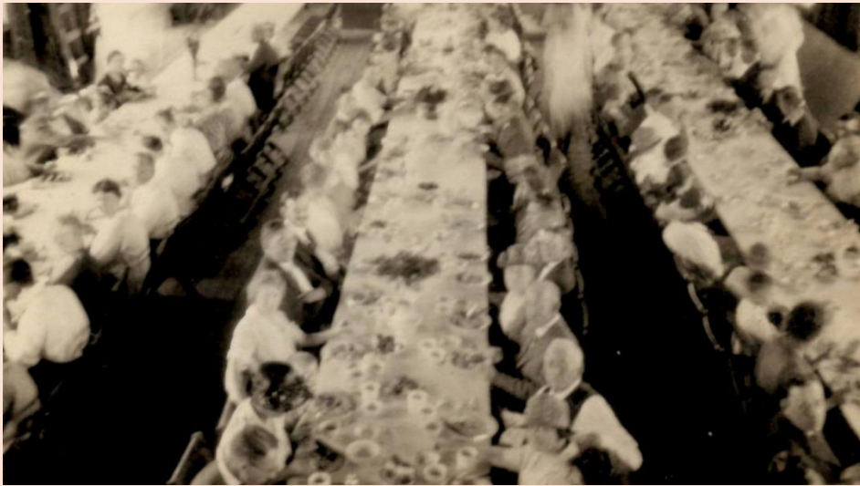
Dining at the New Men's Club