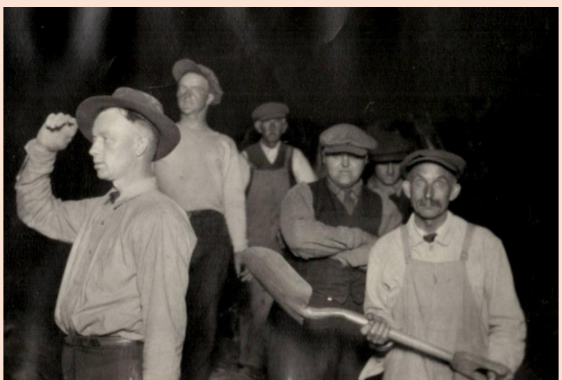
Unidentified Men of the Men's Club “Working Nights”

Before the Men’s Club decided they needed their own structure, they met at the Town Hall, ironically called by locals at that time ‘The Town House.’ It was and is our own Historic Town Hall, now home of the Boylston Historical Society and Museum, Inc. and a place where local organizations meet. The group was so ambitious with plans for lectures, plays, and multiple programs, it pushed them to want a clubhouse of their own where a larger audience could be housed. It took nearly four years from 1922-1926 to complete and dedicate this two story